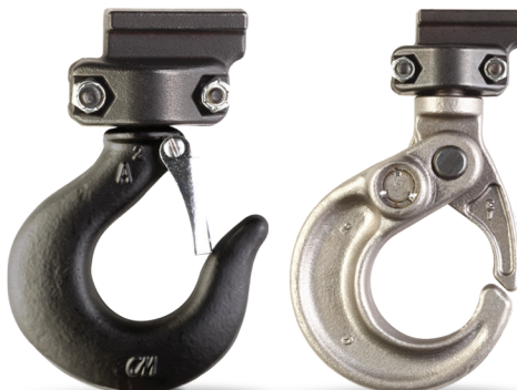
Swivel Hook with latch